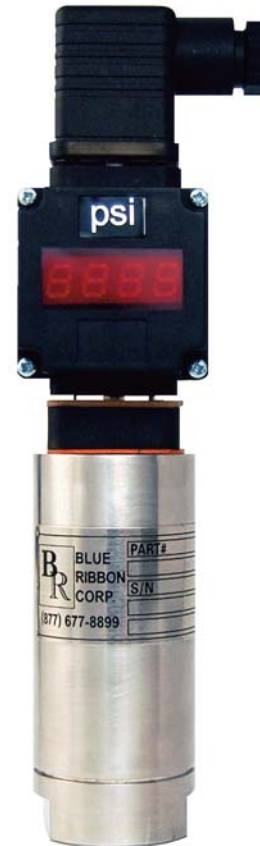
Seen here with Blue Ribbon's Model BR311 Pressure Transmitter

LD1001 is factory set up when ordered with a transmitter for easy field installation.