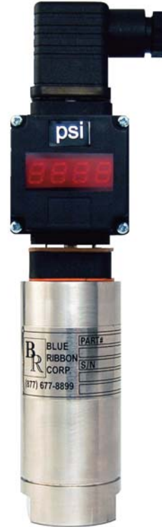
Seen here with Blue Ribbon's Model BR311 Pressure Transmitter

LD1001 is factory set up when ordered with a transmitter for easy field installation.